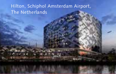
Hilton, Schiphol Amsterdam Airport, The Netherlands

Forest curtain tracks and the Forest Shuttle® motorized curtain tracks are manufactured and marketed worldwide by Forest Group Nederland BV, based in Deventer, The Netherlands. Thanks to their unique quality characteristics and noiseless smooth operation, these pure Dutch products have been used in many homes, offices and 5 Star hotels, all over the world.